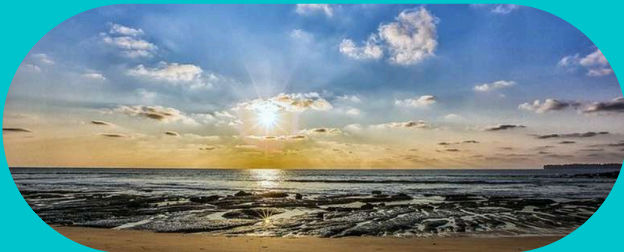
SUNRISE AT NEIL ISLAND