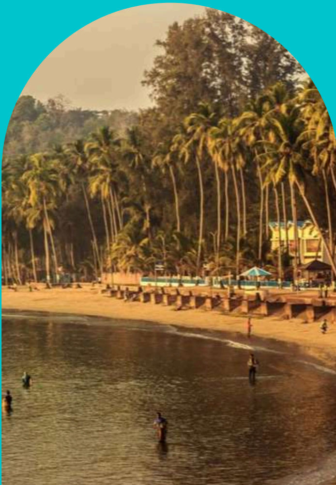
CORBIN COVE BEACH