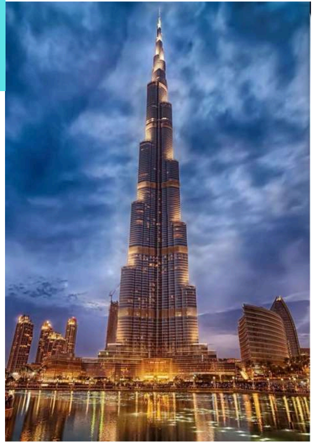
DUBAI CITY TOUR | BURJ KHALIFA