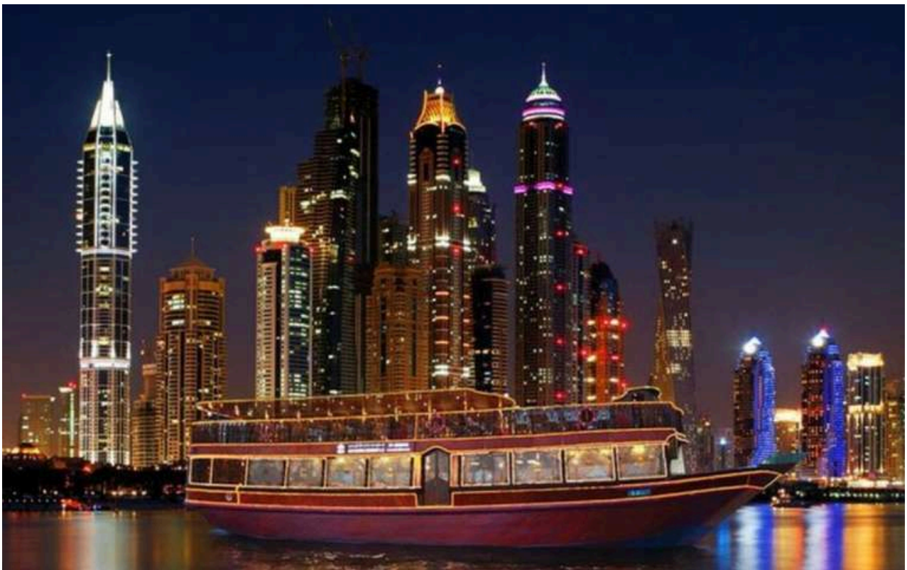
MARINA DHOW CRUISE