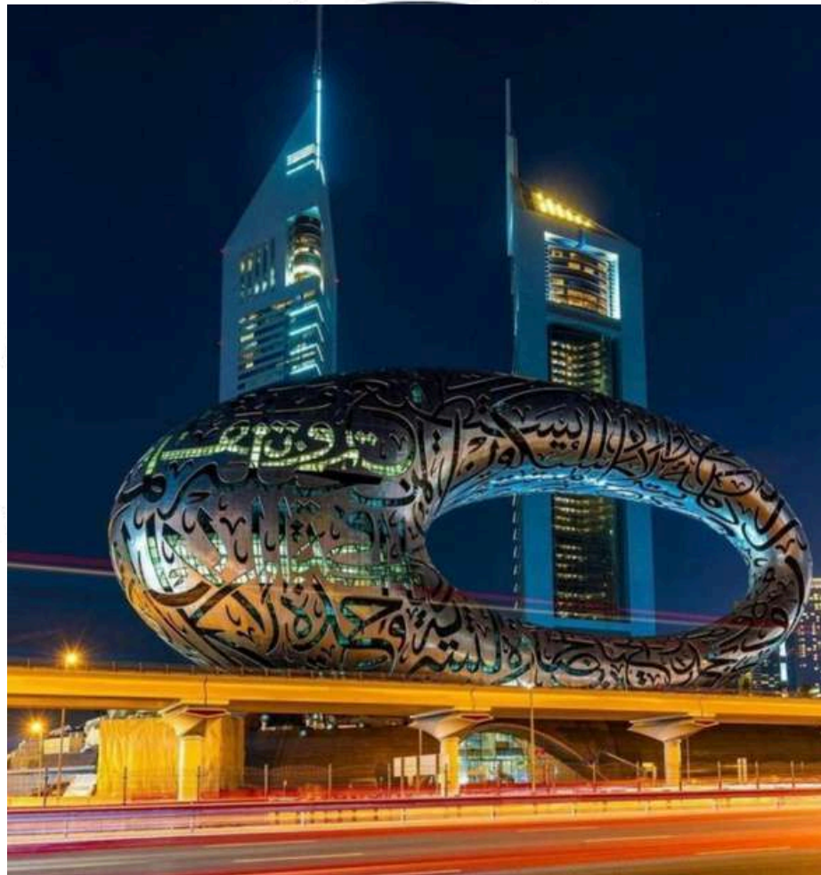
MUSEUM OF THE FUTURE