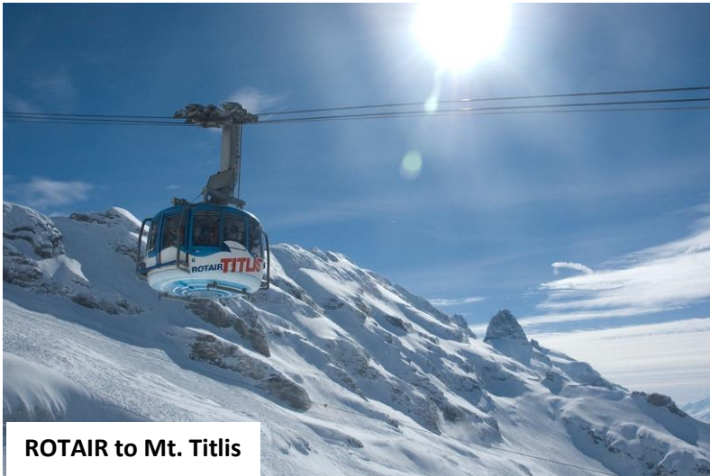
ROTAIR to Mt. Titlis

Overnight stay at hotel in Central Switzerland. (Breakfast, Lunch, Dinner)