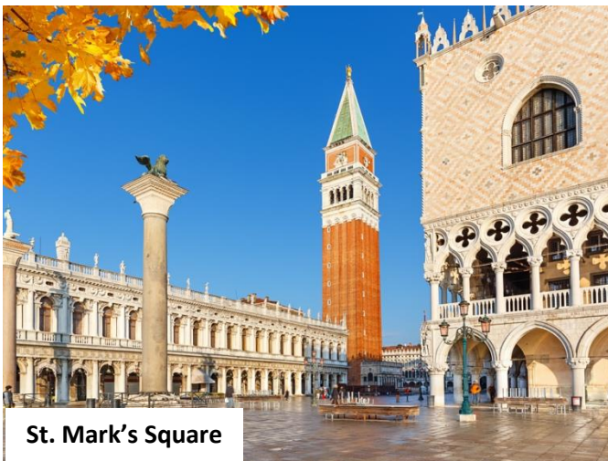
St. Mark's Square

Flat 1, First floor, 14/1 Russa Road East 1st Lane. Kolkata 700033, India